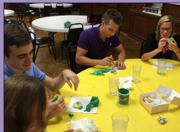
COKE DATE WITH ALPHA XI DELTA