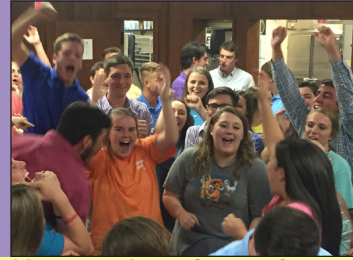
MIXER WITH ALPHA OMICRON PI