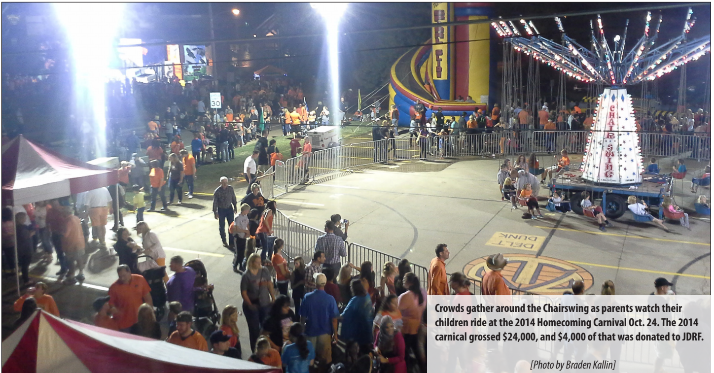
Crowds gather around the Chairswing as parents watch their children ride at the 2014 Homecoming Carnival Oct. 24. The 2014 carnival grossed $24,000, and $4,000 of that was donated to JDRF.