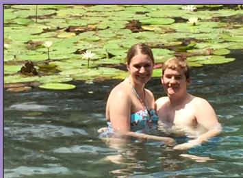
CRUISE TO COZUMEL, MEXICO