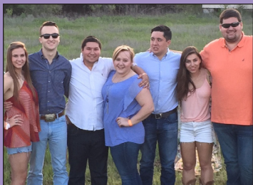
CALF FRY FESTIVAL AT THE TUMBLEWEED