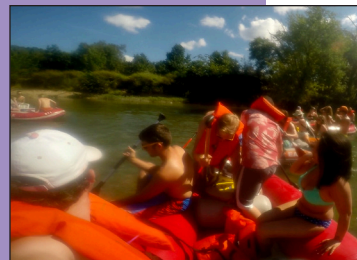
ANNUAL SUMMER FLOAT TRIP