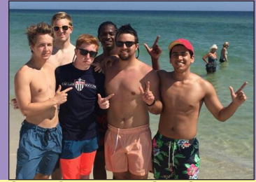
SPRING BREAK ON THE GULF COAST