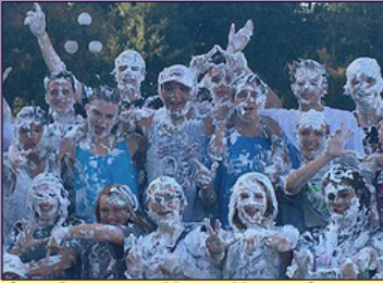
COKE DATE WITH KAPPA KAPPA GAMMA